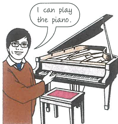
He can play the piano.